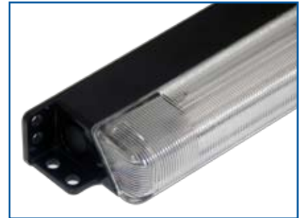
High quality lens will not yellow or break under normal impact.